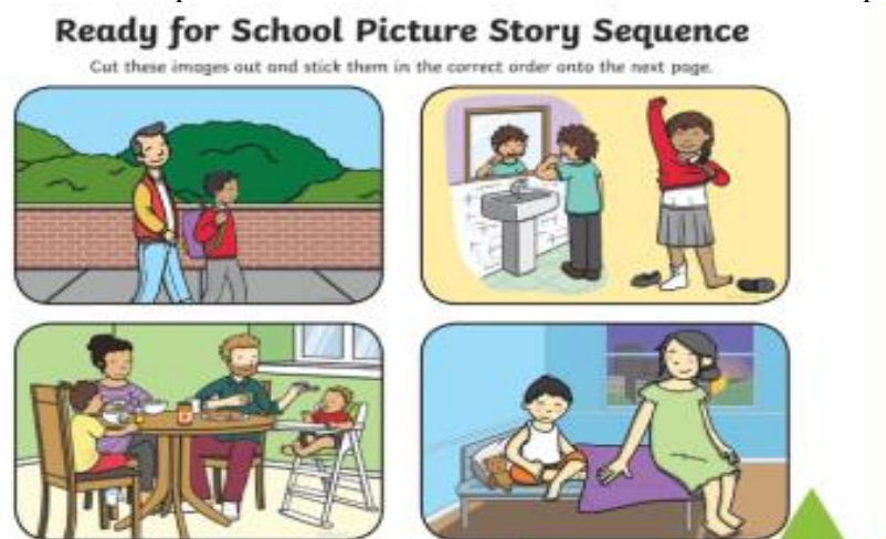
Figure 8: Picture of Ready to School Story Sequence

(Vocabulary: go to school; wash the face; on foot to school; brush teeth; take a bath; ready; have breakfast; together; wake him up; time to school; mother; father; little bother; accompany )