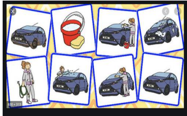
Figure 7: The picture of car washing sequence cards

(Vocabulary: wash; the dirty car; car is clean ; ready; car washer; there is; windows; dirty; clean; water pipe: a pail of water; soap)