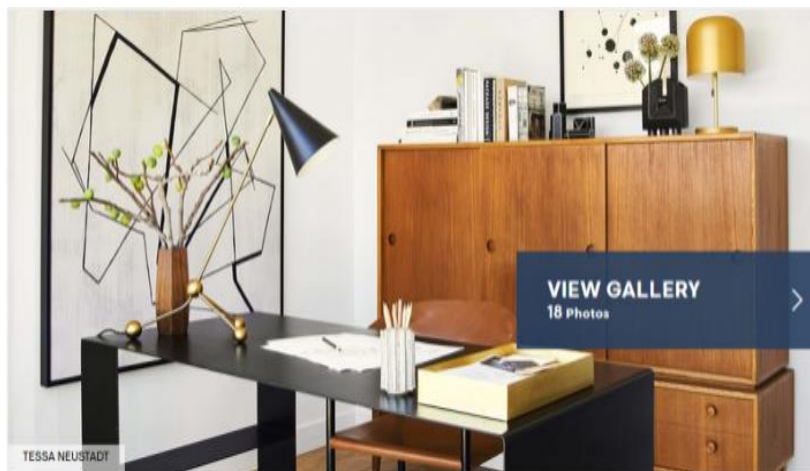
Figure 5: Office Situation