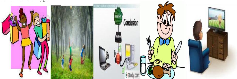
Figure 4: Pictures