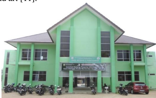
Figure 1: SMKN 4 Pontianak, Kal-Bar.

SMKN 4 is one of Government's favorite schools at Pontianak, in Kal-Bar. It was dominated by boys last time, then now it is opened for girls too. There are 14 programs are offered such as, Computer Network Engineering, Industrial Electrical Engineering, Audio Video Engineering, Spatial Cooling Technique, Electrical Installation, Laboratory Test Analysis, Welding Technique, Mechanical Engineering, Geomatics Engineering, Motorcycle Business Engineering, Technical Light Vehicle, Maintenance Sanitation Building Construction Engineering, Drawing technique, and Property Construction Business Engineering. The numbers of the programs are added in accordance with the demands of society, also job opportunity offered. The Vocational School is vocational high school, abbreviated as SMK, is a formal education at the secondary education level that organizes vocational programs and as the continuation of Junior High school and its levels [10]. SMK is part of the national education system which has a vocational education goal, namely, to produce workforce skilled who has the ability in accordance with the demands of the business needs or industrial world, as well as being able to develop their potential in adopting and adapting to the development of science knowledge, technology and art [11].