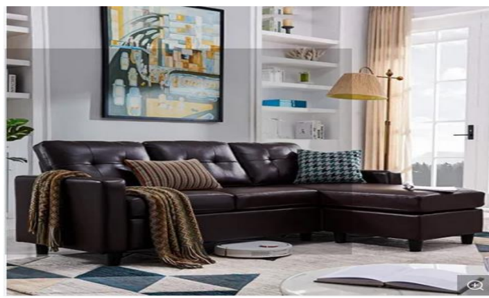
Figure 6: Living room situation

These are the pictures displayed and must be described by learners using prepositions such as, on, in, at, in front of, under, besides, next to, etc. Then all the sentences are joined to be one paragraph. The first is the picture of office situation with all the items in office room. The second is the picture of living room situation with its objects showed. Students have to be able to describe and to posit the objects position precisely. In this second type of Picture –Cued technique it teaches learners with the use of preposition to identify objects location in pictures correctly, besides the correct sentence pattern.