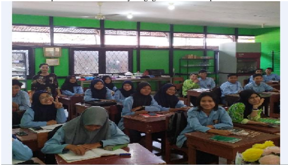
Figure 2 : Classroom Situation of Community Engagement Workshop

Here are the pictures of Community Engagement workshop documentation: