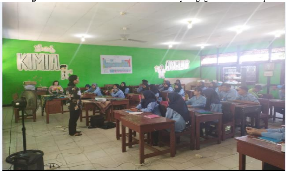
Figure 3 : Classroom Situation of Community Engagement Workshop

There are three activities of Picture-cued technique, those are: